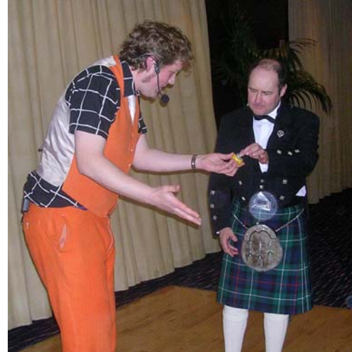
Magic George in full flow