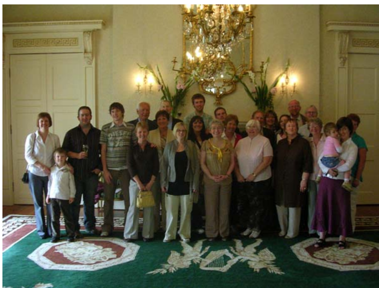
The Link Group in Áras an Uachtaráin—the home of the Irish President.